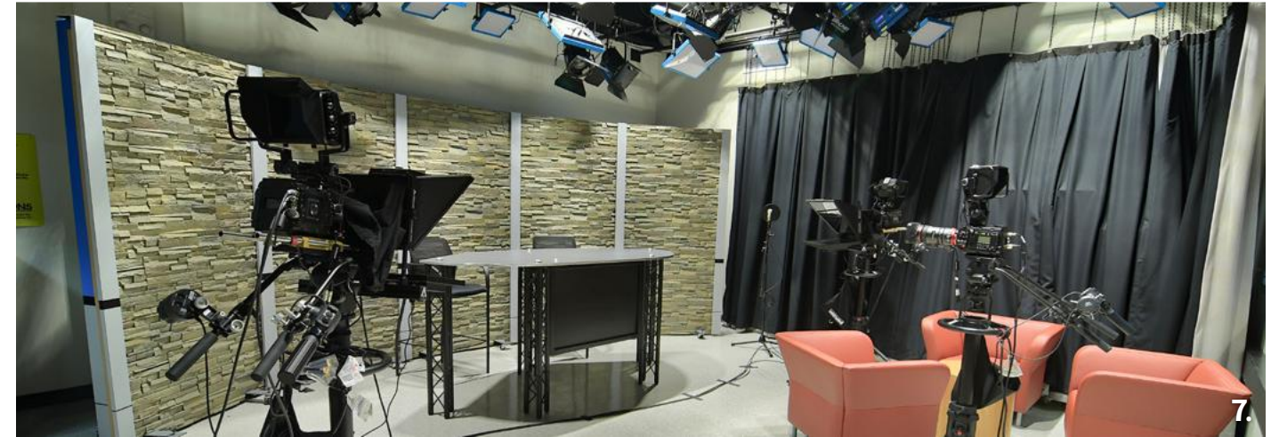
Key: 1. Auto Tech. 2. Art Studio 3. Music Production Classroom 4. & 5. Makerspace 6. Computer Lab 7. TV/Production Studio